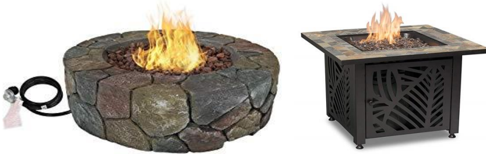
Examples of Acceptable Unenclosed gas appliances used In accordance with (IAW) their Listings – No Permit Required