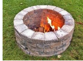
Examples of “Unenclosed” Outdoor Fireplaces/Fire Pits – These Require TFD Notification